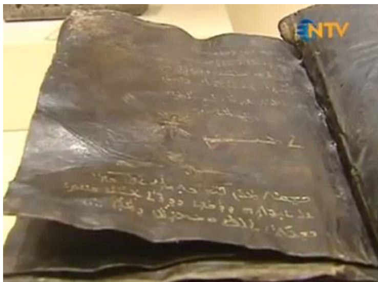
Ancient: The leather-bound text, written on animal hide, was discovered by Turkish police during an anti-smuggling operation in 2000 The leather-bound text, written on animal hide, was discovered by Turkish police during an anti-smuggling operation in 2000.