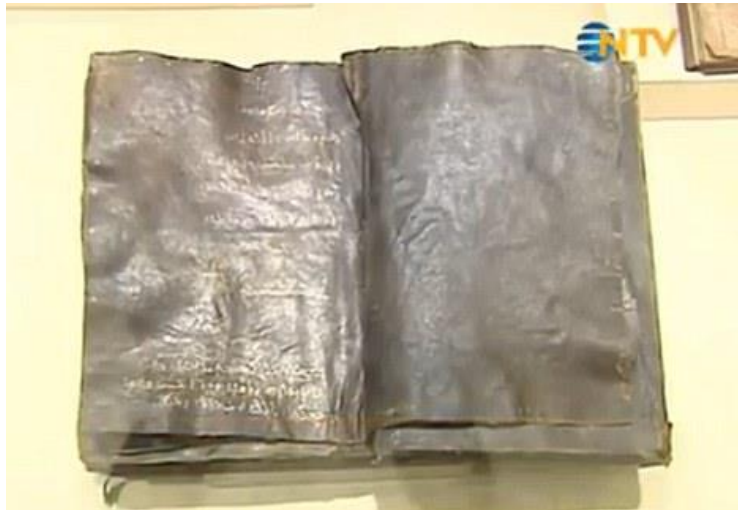
Secret Bible: The 1,500-year-old tome was is said to contain Jesus' early teachings and his prediction of the Prophet's coming

The £14million handwritten gold lettered tome, penned in Jesus' native Aramaic language, is said to contain his early teachings and a prediction of the Prophet's coming.